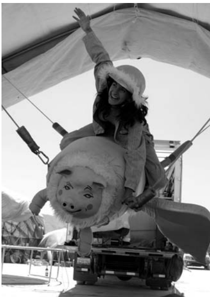
Delta Rodeo rides the wild, winged Pigasus

Serious piggy fun also awaits us at Shambala Mythical Critter Rodeo & Mental State Fair (5:30 & Esplanade). This around-the-clock rodeo offers Pterodactyl riding, Unicorn strutting, Hydra hopping and a 5-person Leviathan. The rodeo centerpiece is Pigasus, a belligerent, female, winged porker. The rider hangs rodeo style until thrown by the snarling sow, watched by an oinking crowd. The record stands at 43 seconds; riders